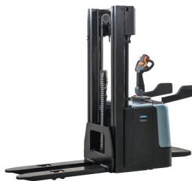
S10/12L-T Capacity: 1.0/1.2T Lifting Height: 3000mm Max.Lifting Height:4500mm ZAPI Full AC Battery: 24V 210AH