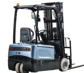
E16/18/20e Capacity: 1.6/1.8/2.0T Lifting Height: 3000mm Max.Lifting Height:6500mm ZAPI Full AC Dual Driven Motors