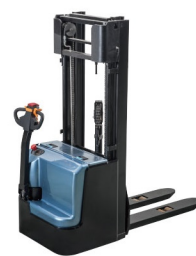
S20L Capacity: 2.0T Lifting Height: 3000mm Max.Lifting Height:4500mm ZAPI Full AC Battery: 24V 240AH