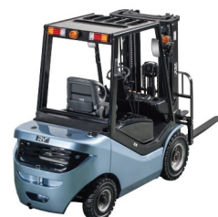
C25 Capacity: 2.5 T Lifting Height: 3000mm Max.Lifting Height:6500mm