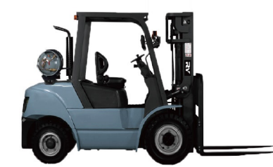
G45/50 Capacity: 4.0/mini5.0 T Lifting Height: 3000mm Max.Lifting Height:6500mm