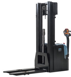
S10/12L Capacity: 1.0/1.2T Lifting Height: 3000mm Max.Lifting Height:4500mm ZAPI Full AC Battery: 24V 210AH