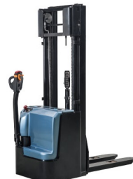
S14L Capacity: 1.4T Lifting Height: 3000mm Max.Lifting Height:4500mm ZAPI Full AC Battery: 24V 210AH