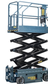
ZS0407/0607(w) Power Type:Electric Driving Type: HD Capacity:280/230kg Working Height: 6.52/7.8m