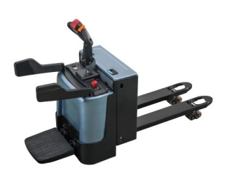
P30-T Capacity: 3.0T Fork Width: 540/685mm Fork Length: 1150/1220mm ZAPI Full AC Battery: 24V 270AH