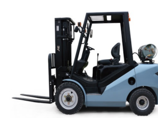
G30/35/40 Capacity: 3.0/3.5/mimi4.0 T Lifting Height: 3000mm Max.Lifting Height:6500mm