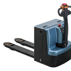
P30 Capacity: 3.0T Fork Width: 540/685mm Fork Length: 1150/1220mm ZAPI Full AC Battery: 24V 270AH