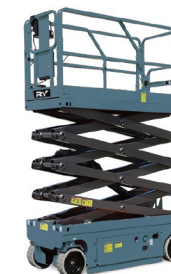
ZS1012 Power Type:Electric Driving Type: HD Capacity:320kg Working Height: 11.96m