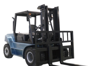
H60/70 Capacity: 6.0/7.0T Lifting Height: 3000mm Max.Lifting Height:6500mm