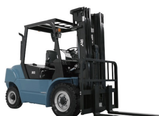
C45/50 Capacity: 4.5/mini5.0T Lifting Height: 3000mm Max.Lifting Height:6500mm