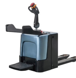
P16/18S-T Capacity: 1.6/1.8T Fork Width: 540/685mm Fork Length: 1150/1220mm ZAPI Full AC Battery: 24V 240AH