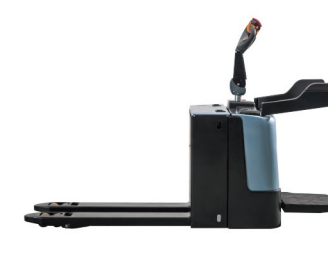
P20/25-T Capacity: 2.0/2.5T Fork Width: 540/685mm Fork Length: 1150/1220mm ZAPI Full AC Battery: 24V 240/270AH