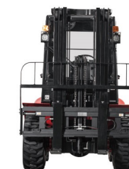
T20/25/30/35A Capacity: 2.0/2.5/3.0/3.5T Lifting Height: 3000mm Max.Lifting Height:6500mm Drive Type: 4x4