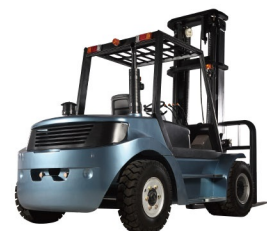
H120 Capacity: 12.0T Lifting Height: 3000mm Max.Lifting Height:6500mm