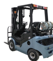
G15/18 Capacity: 1.5/1.8T Lifting Height: 3000mm Max.Lifting Height:6500mm