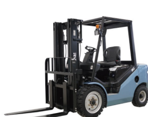
C35 Capacity: 3.5T Lifting Height: 3000mm Max.Lifting Height:6500mm