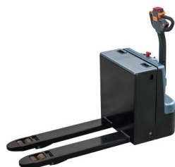
P10/12/14/15 Capacity: 1.0/1.2/1.4/1.5T Fork Width: 540/685mm Fork Length: 1150/1220mm ZAPI Full AC Battery: 24V 210AH