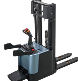
S20L-T Capacity: 2.0T Lifting Height: 3000mm Max.Lifting Height:4500mm ZAPI Full AC Battery: 24V 270AH