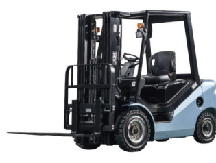
C20 Capacity: 2.0 T Lifting Height: 3000mm Max.Lifting Height:6500mm