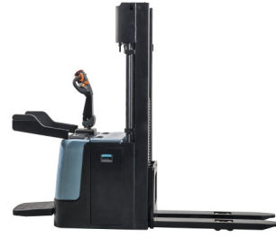
S14L-T Capacity: 1.4T Lifting Height: 3000mm Max.Lifting Height:4500mm ZAPI Full AC Battery: 24V 210AH