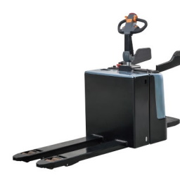
P10/12/14/15S-T Capacity: 1.0/1.2/1.4/1.5T Fork Width: 540/685mm Fork Length: 1150/1220mm ZAPI Full AC Battery: 24V 210AH