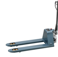
PH15/18 Capacity: 1.5/1.8T Fork Width: 560/685mm Fork Length: 1150/1220mm Battery: 24V 20AH Lithium