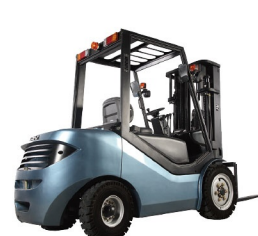
C40 Capacity: mini4.0T Lifting Height: 3000mm Max.Lifting Height:6500mm