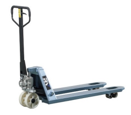
M25/30 Capacity: 2.5/3.0T Fork Width: 520/540/685mm Fork Length: 1100/1150/1220mm Wheel: Pu/Nylon/Rubber