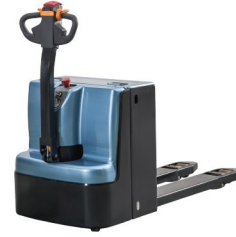
P16/18 Capacity: 1.6/1.8T Fork Width: 540/685mm Fork Length: 1150/1220mm ZAPI Full AC Battery: 24V 240AH