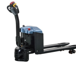
P15 Capacity: 1.5T Fork Width: 550/685mm Fork Length: 1150/1220mm Battery: 24V 85AH