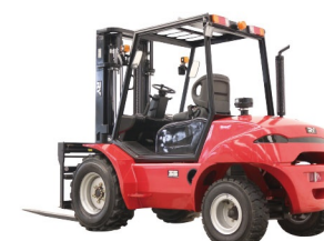
T30/35 Capacity: 3.0/3.5T Lifting Height: 3000mm Max.Lifting Height:6500mm Drive Type: 4x2