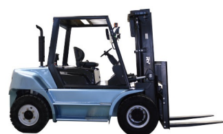
H50 Capacity: 5.0T Lifting Height: 3000mm Max.Lifting Height:6500mm