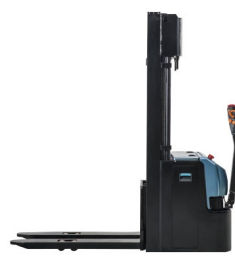
S16/18L Capacity: 1.6/1.8T Lifting Height: 3000mm Max.Lifting Height:4500mm ZAPI Full AC Battery: 24V 240AH