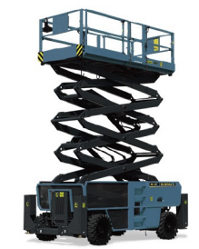
ZS1623RT Scissors Rough Terrain Power Type:Engine Platform Capacity:680kg Working Height: 18m