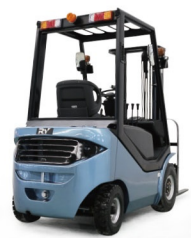
C15 Capacity: 1.5T Lifting Height: 3000mm Max.Lifting Height:6500mm