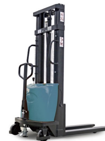
SH10/15/20 Capacity: 1.0/1.5/2.0T Lifting Height: 1600/2000/2500/3000/3500mm Semi Electric