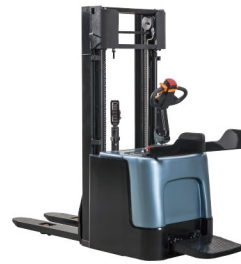
S16/18L-T Capacity: 1.6/1.8T Lifting Height: 3000mm Max.Lifting Height:4500mm ZAPI Full AC Battery: 24V 270AH