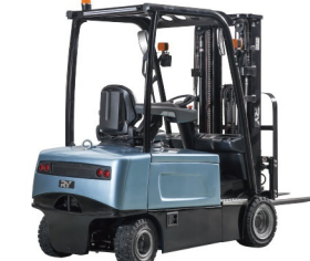
E20/25D Capacity: 2.0/2.5T Lifting Height: 3000mm Max.Lifting Height:6500mm ZAPI Full AC Dual Driven Motors