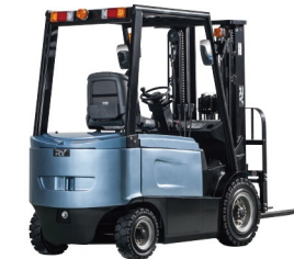
E20/25/30/35 Capacity: 2.0/2.5/3.0/3.5T Lifting Height: 3000mm Max.Lifting Height:6500mm ZAPI Full AC