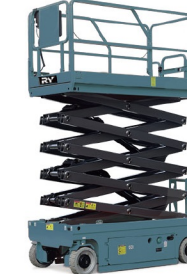
ZS1212 Power Type:Electric Driving Type: HD Capacity:320kg Working Height: 13.9m