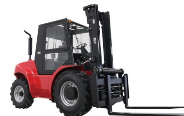
T40/50 Capacity: 4.0/5.0T Lifting Height: 3000mm Max.Lifting Height:6500mm Drive Type: 4x2