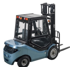
C30 Capacity: 3.0T Lifting Height: 3000mm Max.Lifting Height:6500mm