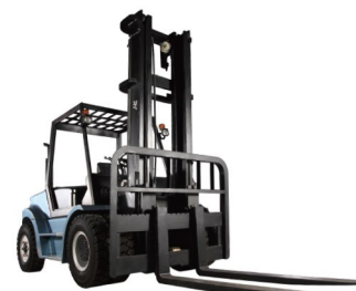
H90/100 Capacity: 9.0/10.0T Lifting Height: 3000mm Max.Lifting Height:6500mm