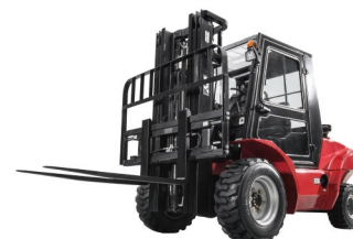
T20/25 Capacity: 2.0/2.5T Lifting Height: 3000mm Max.Lifting Height:6500mm Drive Type: 4x2