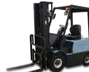
E15/18 Capacity: 1.5/1.8T Lifting Height: 3000mm Max.Lifting Height:6500mm ZAPI Full AC