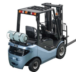
G20/25 Capacity: 2.0/2.5T Lifting Height: 3000mm Max.Lifting Height:6500mm