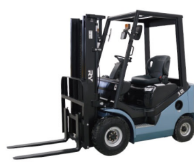
C18 Capacity: 1.8T Lifting Height: 3000mm Max.Lifting Height:6500mm